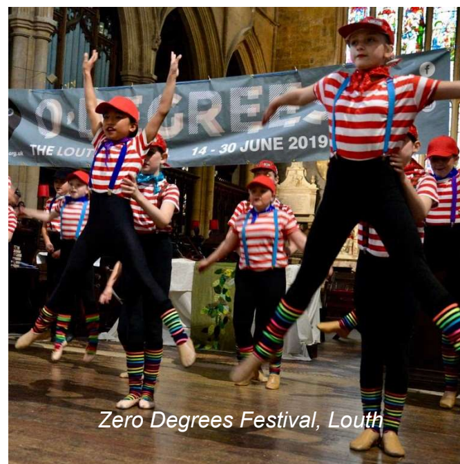
Zero Degrees Festival, Louth