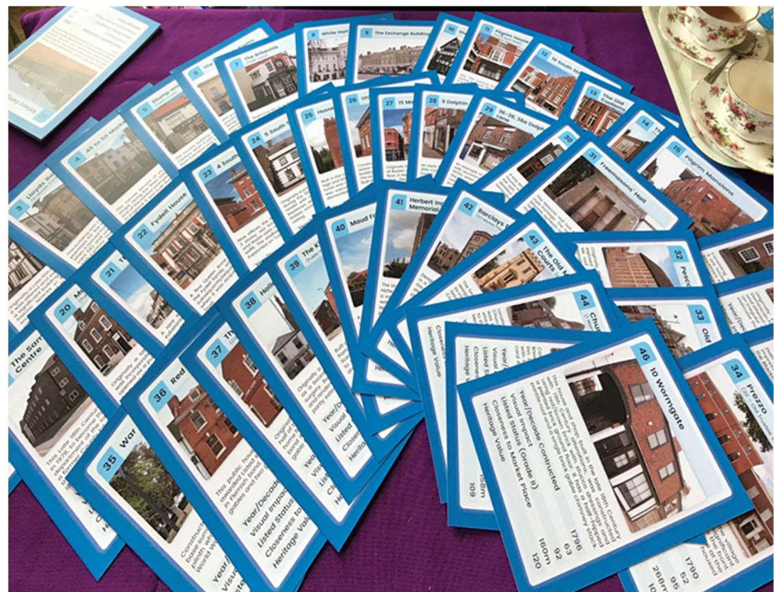
Boston Heritage Trump Cards

Midlands Coast cultural offer which champions environmental sustainability and works with nature as a cultural resource.