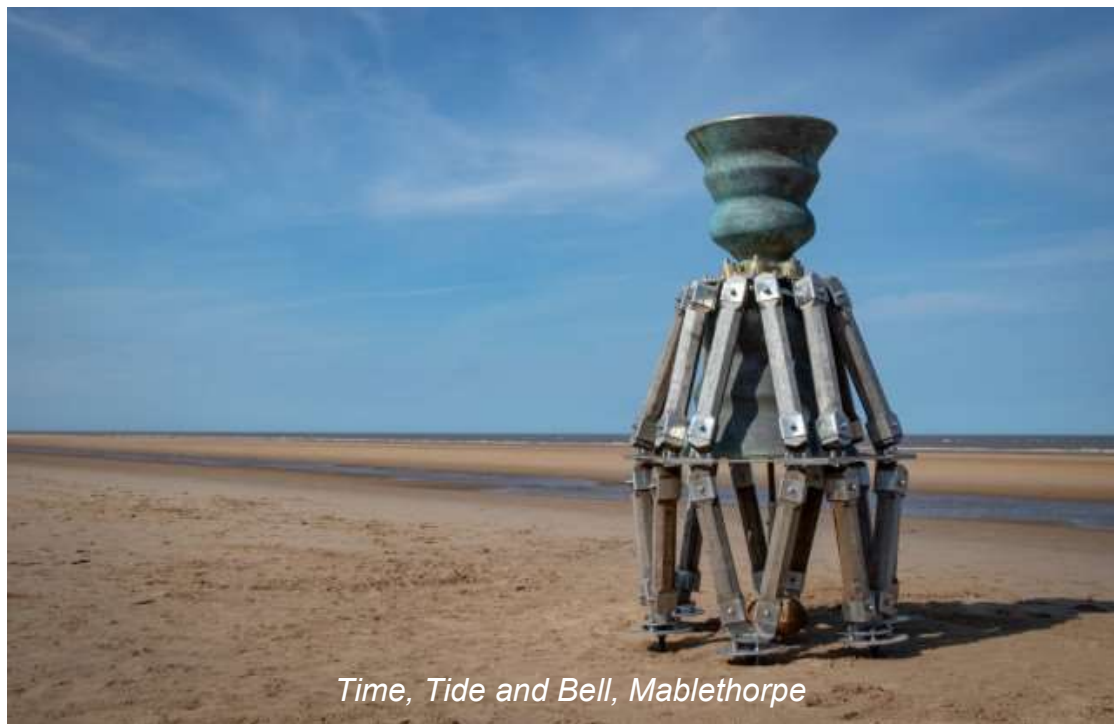
Time, Tide and Bell, Mablethorpe