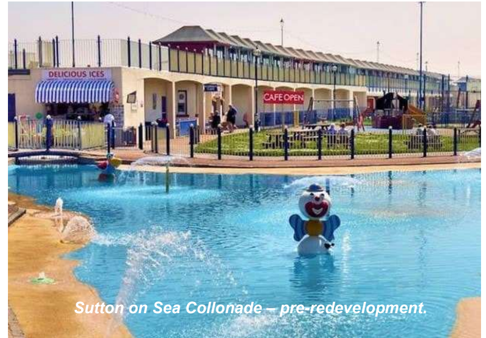
Sutton on Sea Collonade – pre-redevelopment.

Thank you to all who have contributed to this Cultural Framework for Renewal.